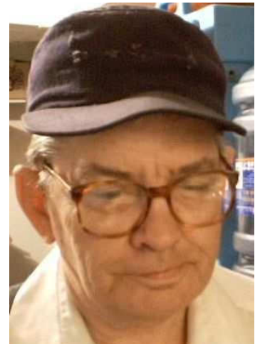
OUR FIRST GUEST March 6th 2000

The Love of God that cares so much that it goes out to convince the least of these that it's for Us.